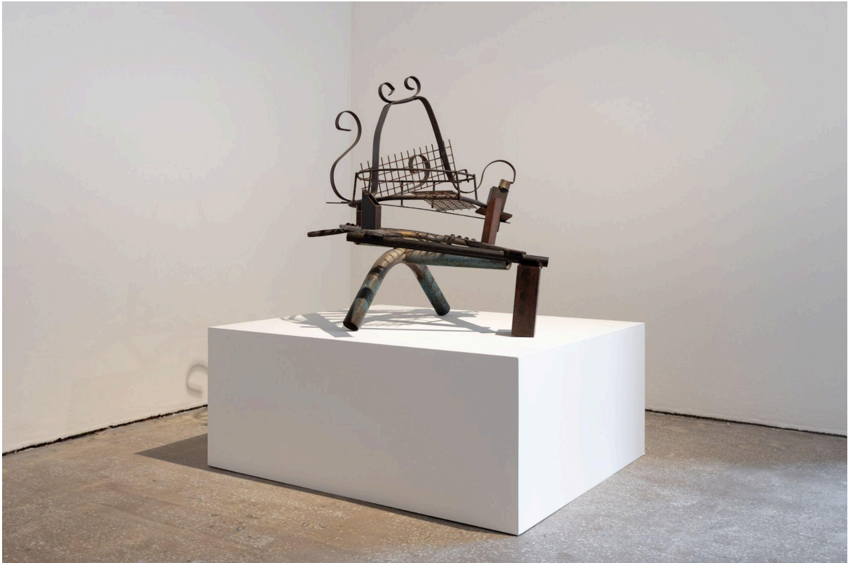
Frank Bowling, The Man Who Mistook His Wife for a Hat (1988)